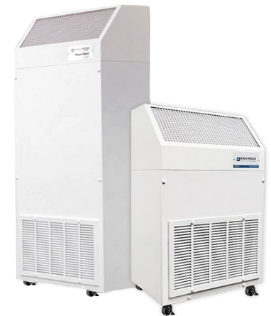
Hospi-Gard® IsoClean® 800

Pattern Room air, along with airborne contaminants, is drawn into the intake grille at the bottom while the purified air is discharged at a high velocity from the exhaust grille located at the top of the IsoClean® to generate a sweeping, low-to high air circulation pattern with adequate "reach" to optimize the clean breathing zone for patient and staff.